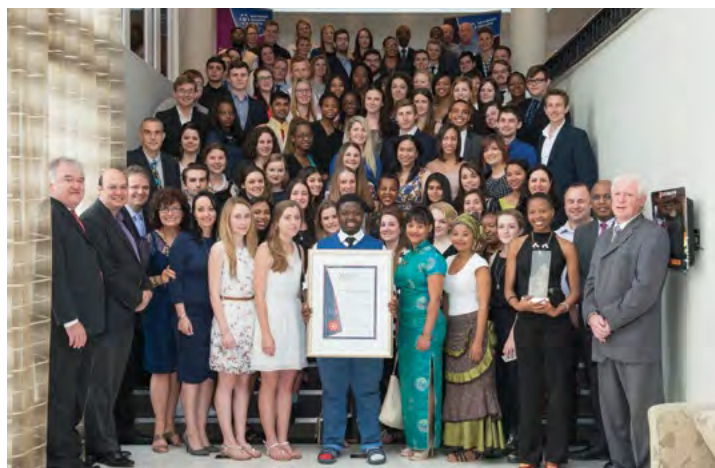
CELEBRATION ... Students and staff enjoy the Pinnacle Leadership Programme end of year breakfast.