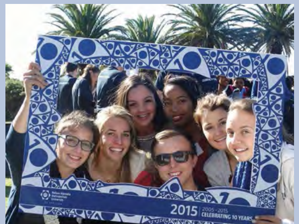
IN THE PICTURE ... Matric learners attending the Grade 12 Accounting Winter School were treated to a party (with a giant cake) to celebrate NMMU's 10th birthday.