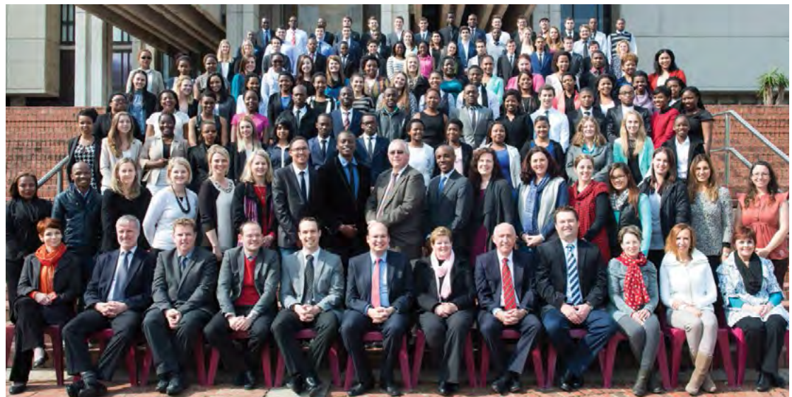
SHARED JOURNEY ... The 2015 Accounting Honours class is photographed with the staff of the School of Accounting.