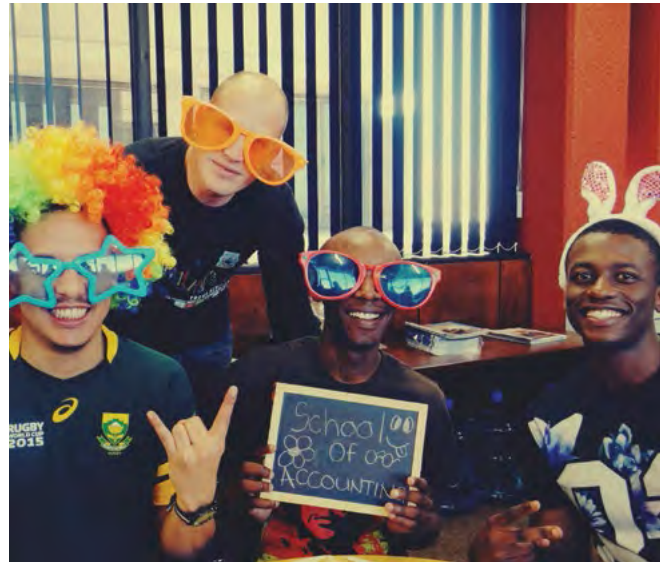
KEEP IT CASUAL ... Casual day keeps it colourful in the School of Accounting.