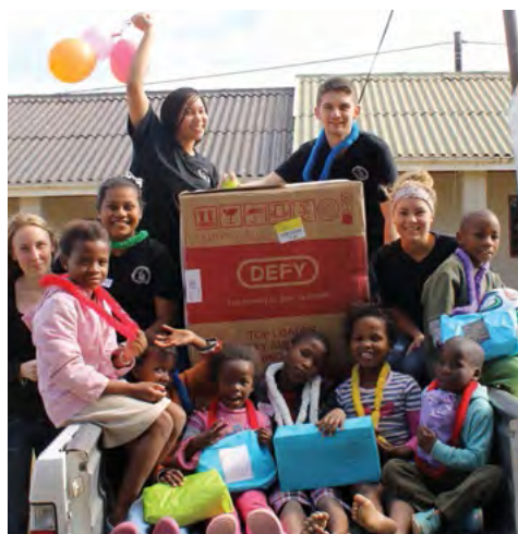
HELPING OTHERS ... Lukhanyiso Children's Home received a brand new washing machine, thanks to the fundraising efforts of Accounting students in the Pinnacle Leadership Programme.