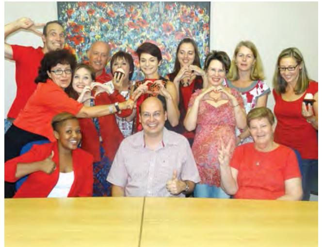
HEARTS AFLUTTER ... School of Accounting staff celebrate Valentine's Day.