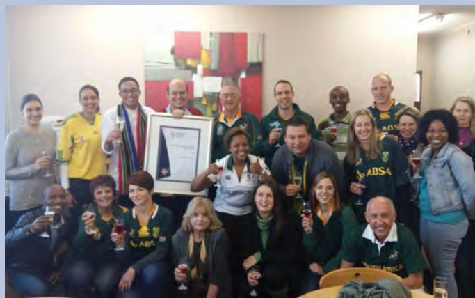
GO, BOKKE! ... School of Accounting staff show their support for South Africa during the Rugby World Cup.