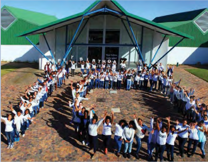
CELEBRATE ... NMMU's 10 year festivities were also celebrated at the George Accounting Winter School.