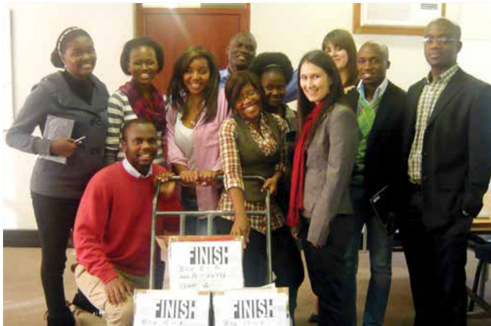
BUSTED ... Internal Auditing students get to grips with the many boxes of evidence in a fraud investigation, in which they assisted the SAPS and Volkswagen SA.

FOR 10 days during the June 2012 holidays, 11 postgraduate students in Internal Auditing gained first-hand experience in fraud investigation by assisting the SAPS and Volkswagen South Africa with a case involving millions of rands.