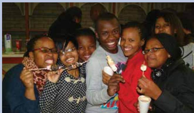
WELCOME BACK ... Thuthuka students at the second semester "I'm a survivor" welcome back function enjoy hot chocolate and marshmallows.